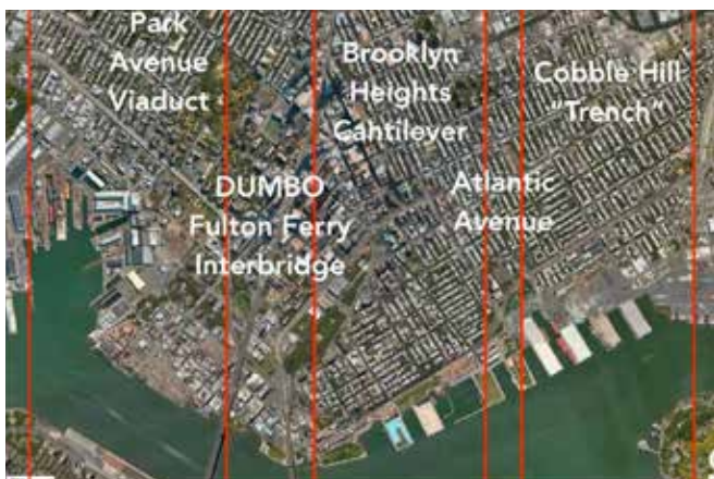
Relevant Workshop II sub-areas