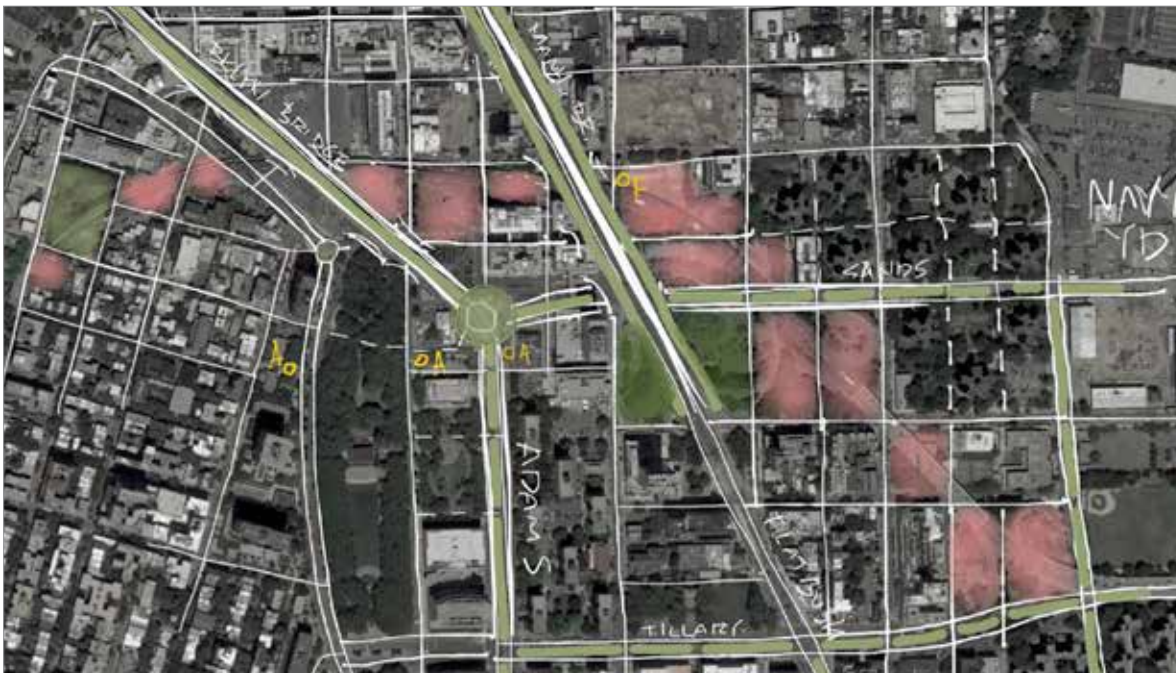
Sketch showing new boulevards, parks, plaza, subway connections, and 14 development parcels if the BQE and its ramps were removed.

Eminently safer streets minus the BQE traffic.