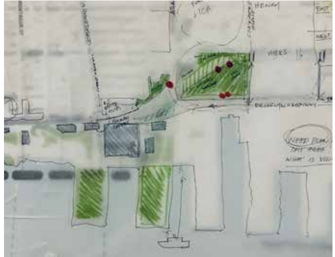
BQE Connection at Atlantic Avenue.

The Atlantic Ave. connection and potential effects of redesign on surrounding areas and neighborhoods has not been adequately studied but should be considered during short- and long-term BQE reconstruction integration strategies.